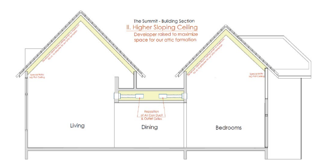
Fig. 2(b): Building section drawing of the Unit