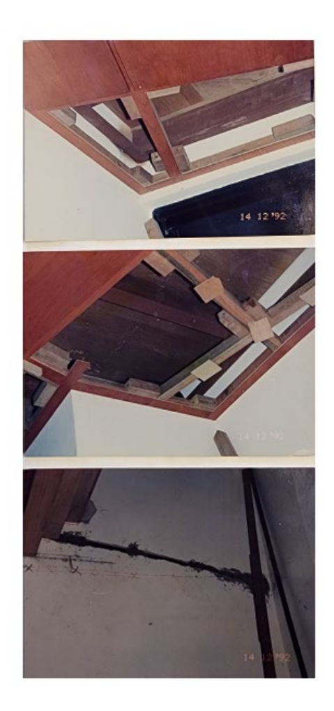
Fig. 5: Photographs allegedly showing the installation of the mezzanine attics dated 14 December 1992

34 The defendants also exhibited copies of photographs (Fig. 5 below) showing the installation of the mezzanine attics being carried out, dated 14 December 1992:<sup>38</sup>