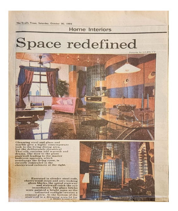
Fig. 6: Copy of the Straits Times article dated 30 October 1993 exhibited by the defendants

35 The defendants claimed that their installation of mezzanine attics and staircases in the Unit was "public knowledge" and even reported in the national press. To this end, the defendants relied on a Straits Times article dated 30 October 1993 (Fig. 6 below) showcasing the Unit, which also included a photograph of the aforesaid staircases:<sup>39</sup>