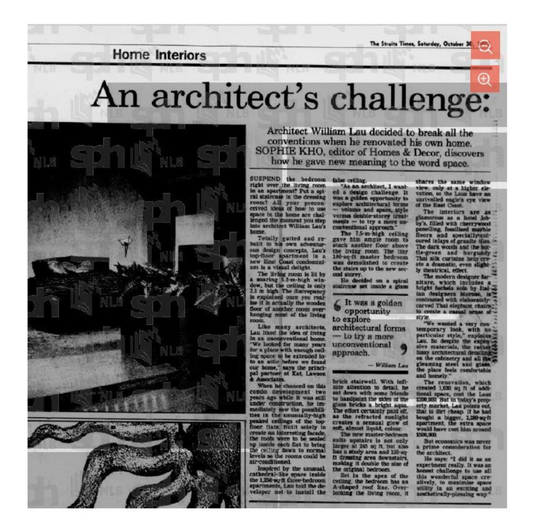
Fig. 7: Copy of the full Straits Times article dated 30 October 1993 exhibited by the MCST

42 At the oral hearing, the MCST also highlighted that, according to the copy of the Straits Times article exhibited by the MCST (see Fig. 7 above), the defendants had told the author of the article that their renovation had "created 1,030 sq ft of additional space", ie approximately 95.69m<sup>2</sup>. The MCST proceeded on the basis that this referred to the additional floor area generated by the unauthorised mezzanine attics and staircases. Yet when the defendants