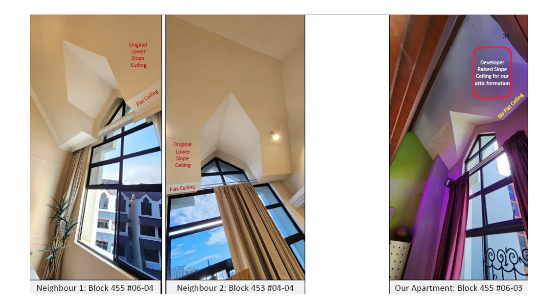
Fig. 3: Photograph and annotations by the defendants to compare the Unit with other units in the development