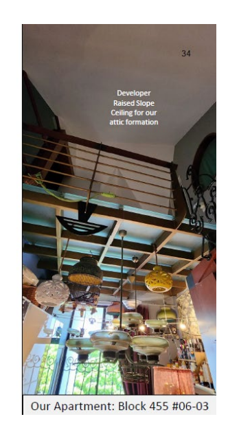
Fig. 4: Photograph and annotations by the defendants to compare the Unit with other units in the development